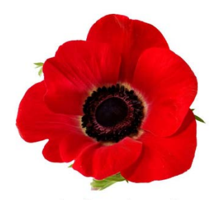
Lest we forget